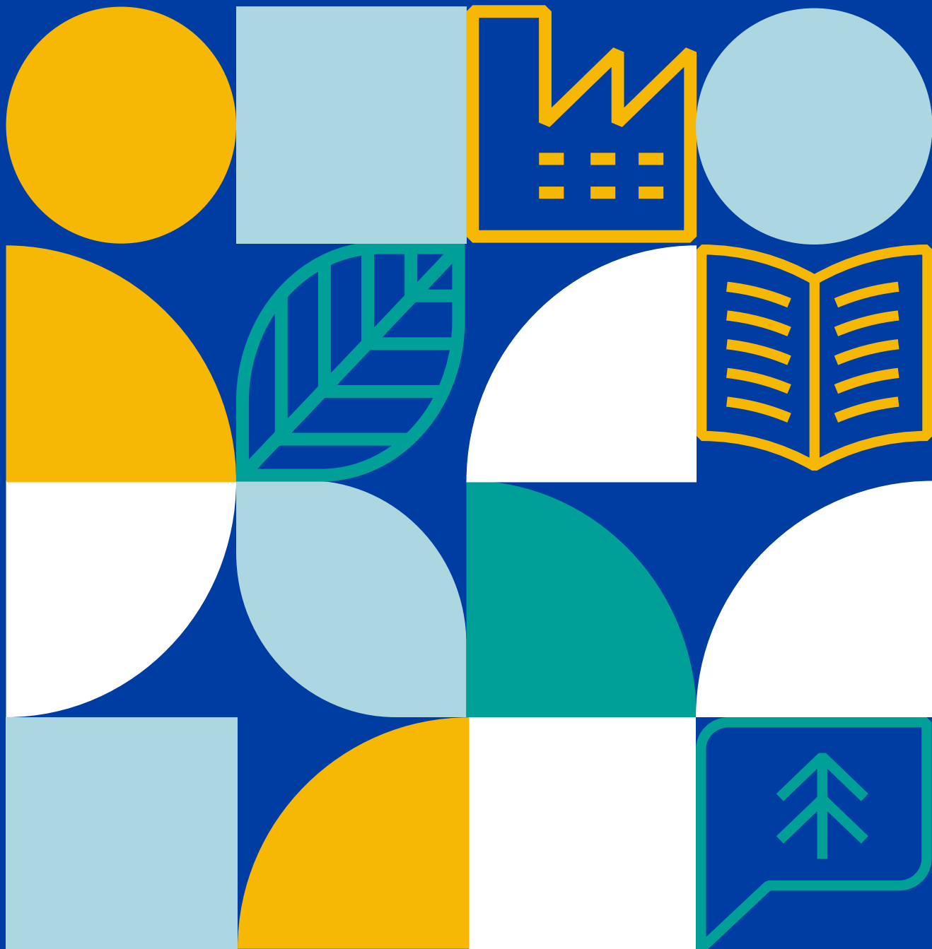
Exhibit at EUBCE 2024

24 – 27 June Conference and Exhibition, Marseille, France