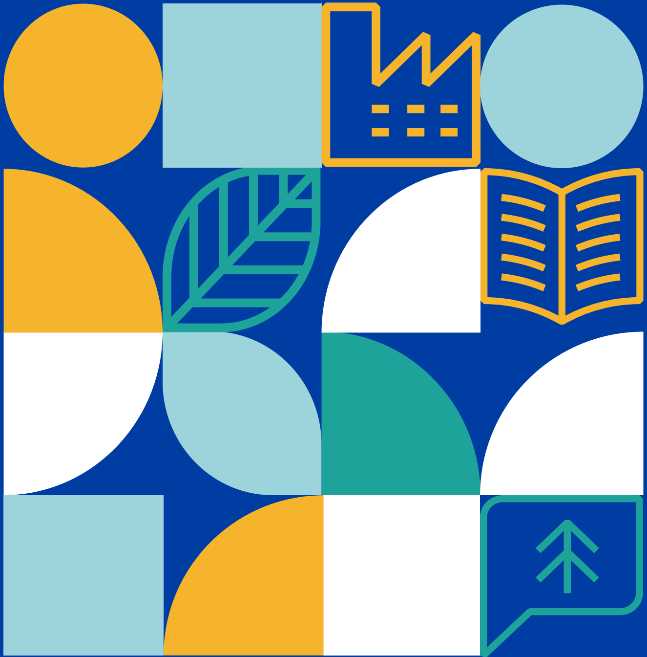
Exhibit at EUBCE 2024

24 – 27 June Conference and Exhibition, Marseille, France